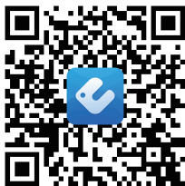
App Download Linkage

Scan the QR code or search "Ewpe Smart" in the application market to download and install it. When "Ewpe Smart" App is installed, register the account and add the device to achieve long-distance control and LAN control of smart home appliances.